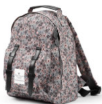
Petite Botanic 50880112560NA