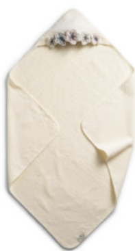
Embedding Bloom 70660116600NA