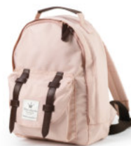
Powder Pink 50880119152NA