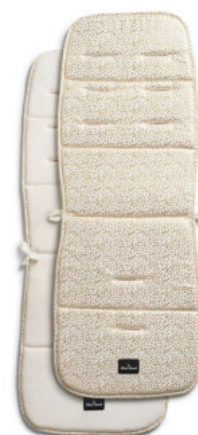
Gold Shimmer 50770117540NA