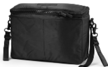
Brilliant Black 50670127122NA Organizer