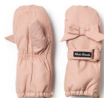
Powder Pink 1-3y 50620116152EF