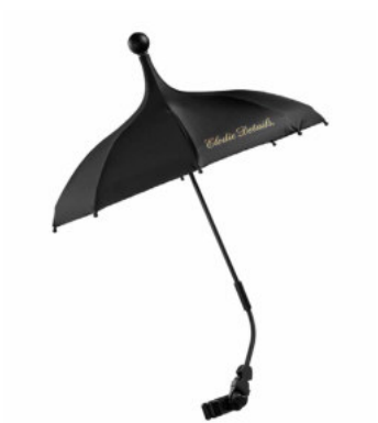
Brilliant Black 50230111122NA