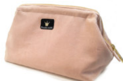
Powder Pink 50610113152NA