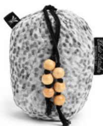
Dots of Fauna 50240114520NA