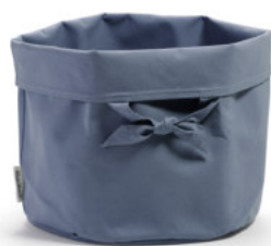
Tender Blue 70650121190NA