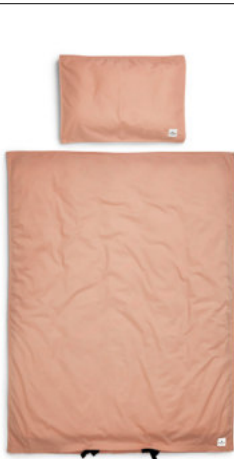
Faded Rose 70220123150NA