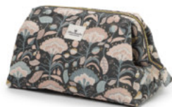
Midnight Bells 50610119554NA