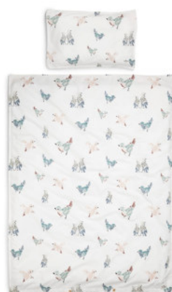
Feathered Friends 70220125568NA