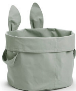
Mineral Green 70650124184NA