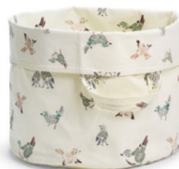
Feathered Friends 70650125568NA