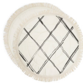
Flowing Lines 70830115536NA