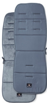
Tender Blue 50770121190NA