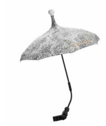
Dots of Fauna 50230116520NA