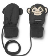
Playful Pepe 0-12m 50620117620EC