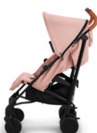
Faded Rose 80800122150SC