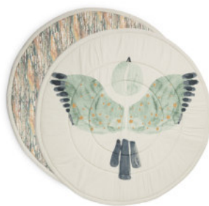
Watercolor Wings 70830121850NA