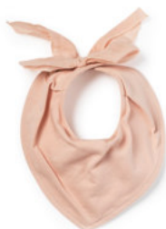
Powder Pink 30440116152NA