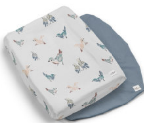
Feathered Friends 70210114568NA