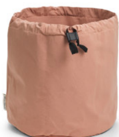
Faded Rose 70650123150NA