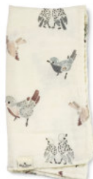
Feathered Friends 30350126568NA