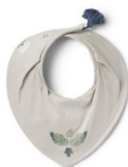
Watercolor Wings 30440121850NA