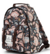
Midnight Bells 50880116554NA