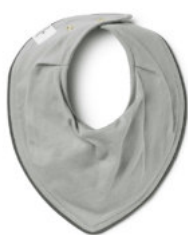
Mineral Green 30440122184NA