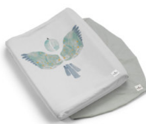
Watercolor Wings 70210116850NA