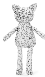
Dots of Fauna Kitty 70370116520NA