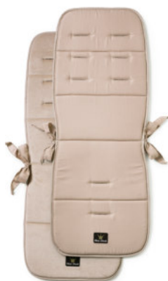
Powder Pink 50770113152NA