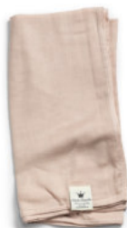
Powder Pink 30350114152NA