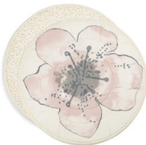
Embedding Bloom Pink 70830117604NA