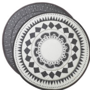
Graphic Devotion Grey 70830122544NA