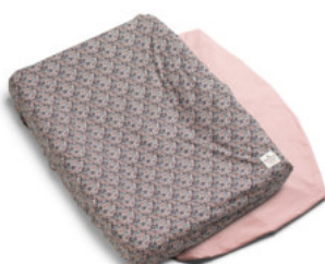
Petite Botanic 70210111560NA