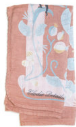
Faded Rose Bells 30350124852NA