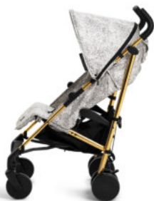
Dots of Fauna 80800121520SC