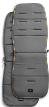
Golden Grey 50770118132NA