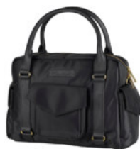
Black Edition 50670125120NA