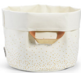
Gold Shimmer 70650122540NA