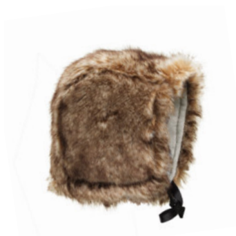
Not FURReal 0-12m

50540119146DC (0-6m) 50540119146DD (6-12m)