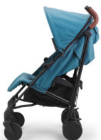
Pretty Petrol 80800119182SC