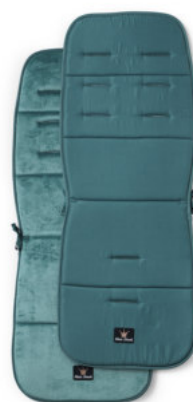
Pretty Petrol 50770114182NA