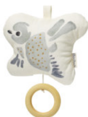
Watercolor Wings 70840119850NA