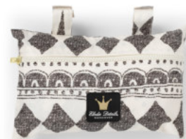
Graphic Devotion 50700115544NA