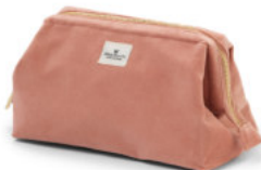
Faded Rose 50610118150NA