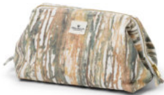
Unicorn Rain 50610124566NA