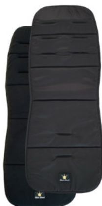
Black Edition 5077011120NA