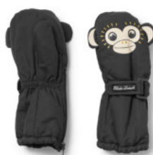
Playful Pepe 1-3y 50620118620EF