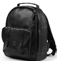
Black Leather 50880114120NA Genuine Leather