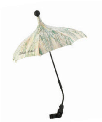
Unicorn Rain 50230117566NA