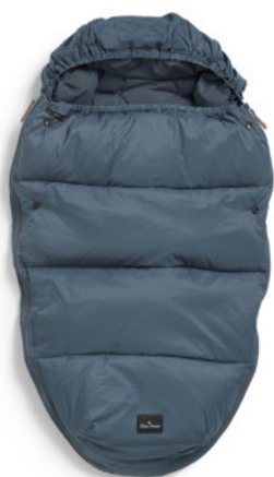
Tender Blue 50515114190NA