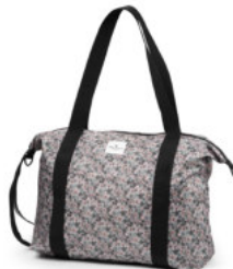
Petite Botanic 50670112560NA Sporty, Light Weight