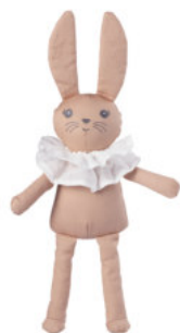
Loving Lily 70370111152NA