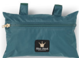
Pretty Petrol 50700117182NA