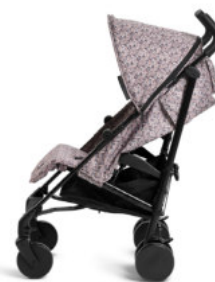
Petite Botanic 80800120560SC