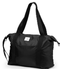
Brilliant Black 50670111122NA Sporty, Light Weight