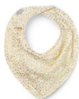
Gold Shimmer 30440118540NA