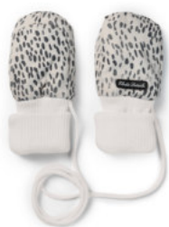
Dots of Fauna 0-12m 50620113520EC