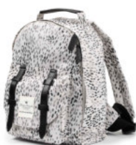
Dots of Fauna 50880113520NA