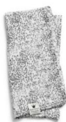
Dots of Fauna 30350118520NA