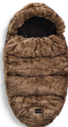
Not FURReal 50500117146NA