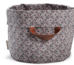
Petite Botanic 70650119560NA