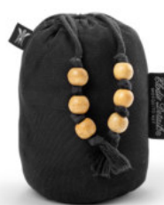
Brilliant Black 50240111122NA