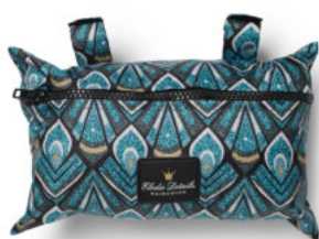
Everest Feathers 50700122532NA