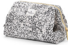
Dots of Fauna 50610121520NA