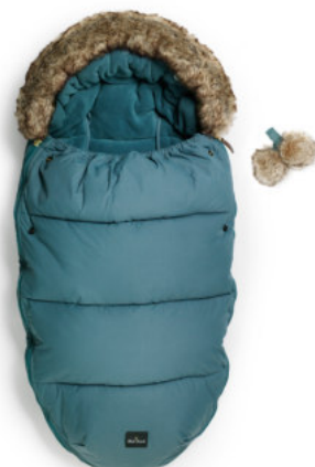
Pretty Petrol 50500114182NA