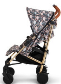
Midnight Bells 80800123554SC