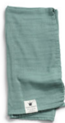
Mineral Green 30350116184NA