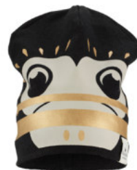
Gilded Playful Pepe

50530123554DC (0-6m) 50530123554DD (6-12m) 50530123554DE (1-2y) 50530123554DF (2-3y)