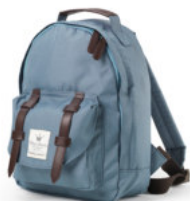
Pretty Petrol 50880120182NA