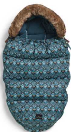
Everest Feathers 50500116532NA