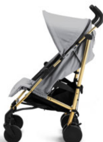
Golden Grey 80800112132SC