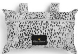
Dots of Fauna 50700119520NA