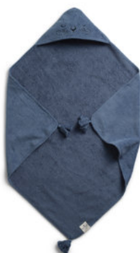
Tender Blue 70660117190NA