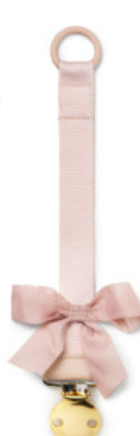
Powder Pink 301 501 20152NA