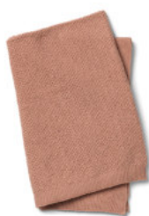
Faded Rose 30380116150NA