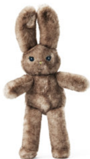
Fluffy Frank 70370119146NA