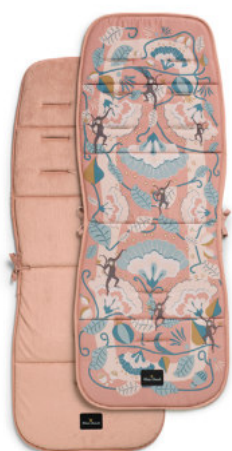
Midnight Bells 50770119852NA