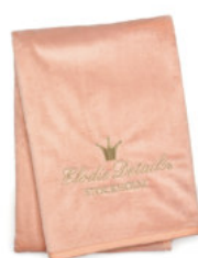
Faded Rose 30320121150NA