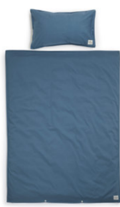
Tender Blue 70220122190NA