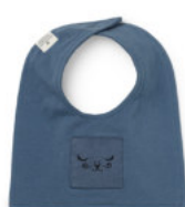
Tender Blue 30440119190NA