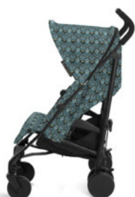
Everest Feathers 80800124532SC