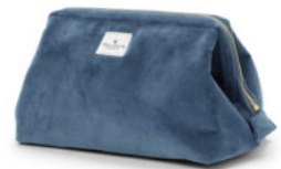
Tender Blue 50610122190NA