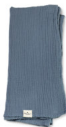
Tender Blue 30350127190NA