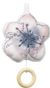
Embedding Bloom 70840117600NA