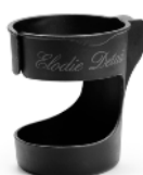
Cup Holder 80800125120NA See website for details