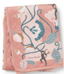
Midnight Bells 30320119554NA