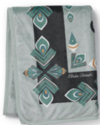
Everest Feathers 30320118532NA