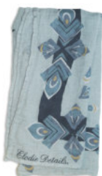
Everest Feathers 30350123854NA