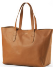
Chestnut Leather 50670120142NA Genuine Leather