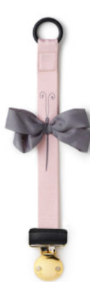
Dragonfly 301 501 31522NA