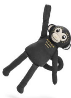
Playful Pepe 70370120620NA