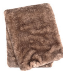
Not FURReal 30320122146NA