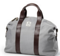
Gilded Grey 50670123132NA