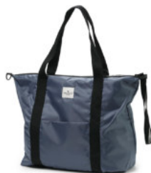
Tender Blue 50670116190NA Sporty, Light Weight