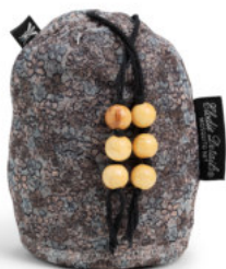
Petite Botanic 50240115560NA