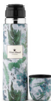
Forest Flora 50250112538NA