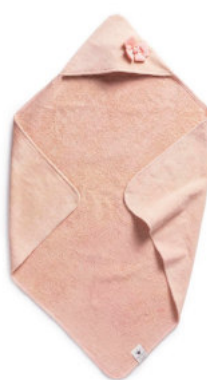
Powder Pink 70660114152NA