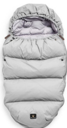
Marble Grey 50515113130NA