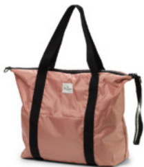
Faded Rose 50670113150NA Sporty, Light Weight