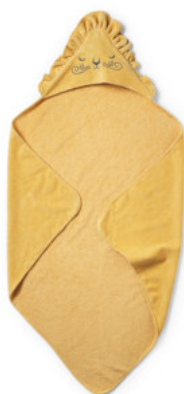
Sweet Honey Harry 70660113170NA