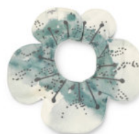
Embedding Bloom 30440120600NA