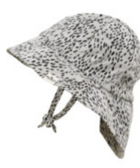
Dots of Fauna

50580117540DC (0-6m) 50580117540DD (6-12m) 50580117540DE (1-2y) 50580117540DF (2-3y)