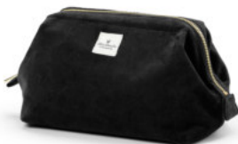
Brilliant Black 50610123122NA