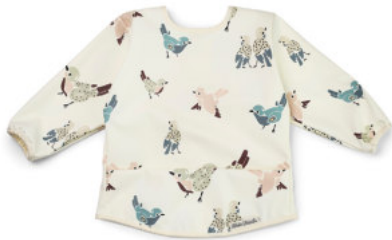
Feathered Friends 30410101568NA