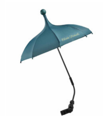
Pretty Petrol 50230114182NA