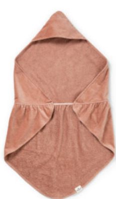
Faded Rose 70660118150NA