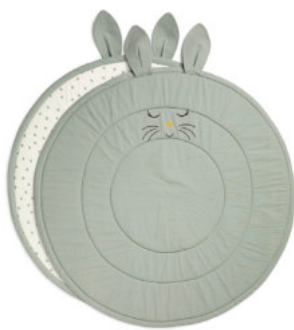
Mineral Green 70830119184NA