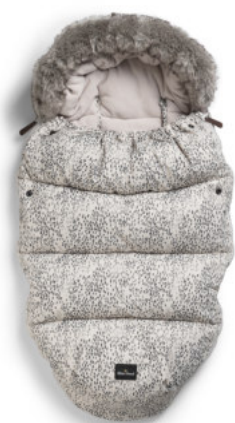
Dots of Fauna 50500112520NA