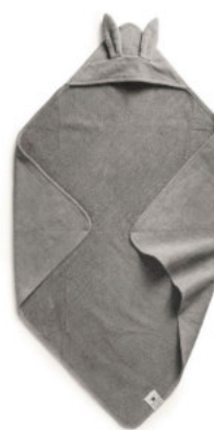
Marble Grey 70660111130NA