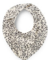
Dots of Fauna 30440117520NA