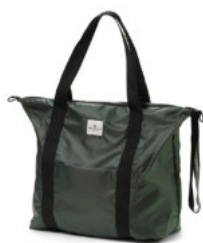
Valley Green 50670114180NA Sporty, Light Weight