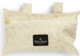
Gold Shimmer 50700120540NA