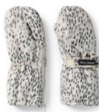
Dots of Fauna 1-3y 50620114520EF