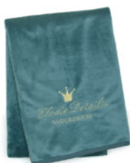
Pretty Petrol 30320115182NA