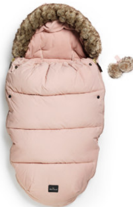
Powder Pink 50500113152NA