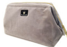
Marble Grey 50610112130NA