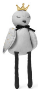
Feathered Fiona 70370122850NA