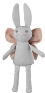
Tender Bunnybelle 70370113130NA