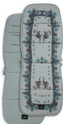
Everest Feathers 50770120854NA