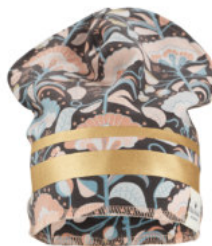
Gilded Midnight Bells

50530119532DC (0-6m) 50530119532DD (6-12m) 50530119532DE (1-2y) 50530119532DF (2-3y)