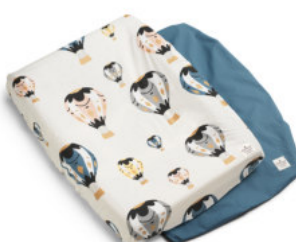
Moon Balloon 70210113556NA