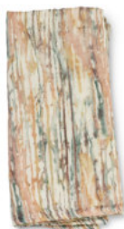
Unicorn Rain 30350125566NA