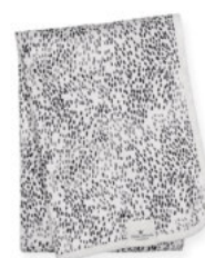
Dots of Fauna 30320114520NA