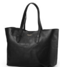
Black Leather 50670119120NA Genuine Leather