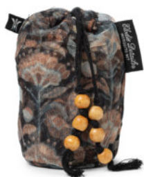
Midnight Bells 50240116554NA