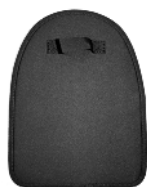
Included seat cushion