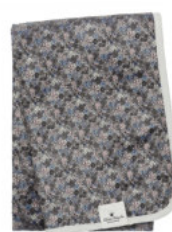
Petite Botanic 30320113560NA