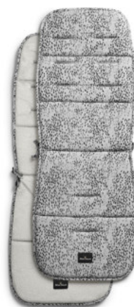
Dots of Fauna 50770116520NA