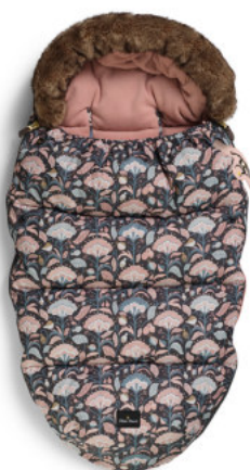
Midnight Bells 50500115554NA