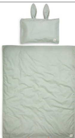
Mineral Green 70220124184NA