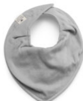
Grey Bamboo 30440111130NA