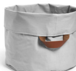
Marble Grey 70650114130NA