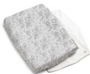
Dots of Fauna 70210112520NA