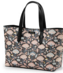
Midnight Bells 50670126554NA