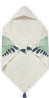
Watercolor Wings 70660120850NA