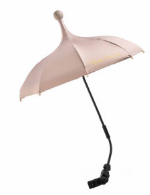
Powder Pink 50230113152NA