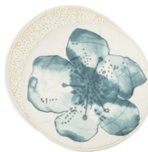
Embedding Bloom Petrol 70830118602NA