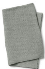
Mineral Green 30380114184NA