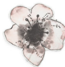
Embedding Bloom Pink 30350121604NA