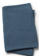
Tender Blue 30380111190NA