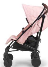
Powder Pink 70650119560NA