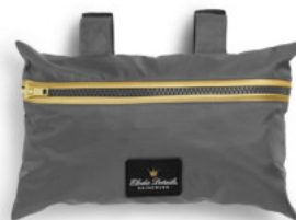
Golden Grey 50700121132NA