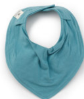
Pretty Petrol 30440114182NA