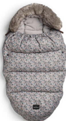
Petite Botanic 50500111560NA