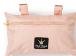
Powder Pink 50700116152NA