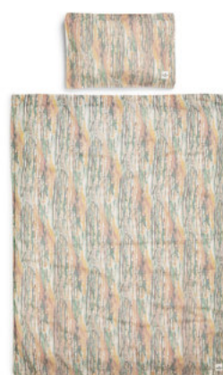
Unicorn Rain 70220126566NA