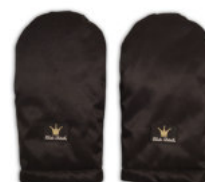
Stroller Mittens Black Edition 50620555120NA