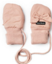
Powder Pink 0-12m 50620115152EC