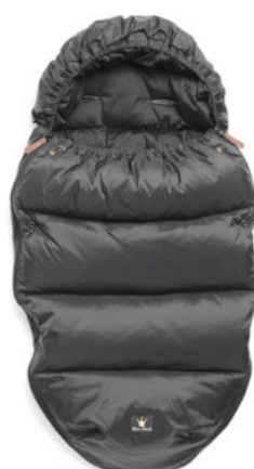
Midnight Black 50515112120NA