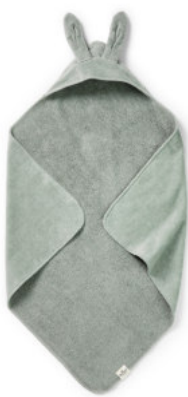
Mineral Green 70660119184NA