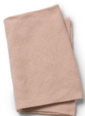
Powder Pink 30380112152NA