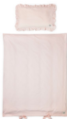
Powder Pink 70220119152NA