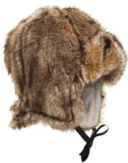
Not FURReal 1-3y

50540119146DC (0-6m) 50540119146DD (6-12m)