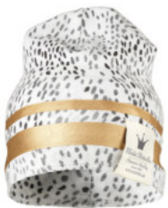
Gilded Dots of Fauna

50530131520DC (0-6m) 50530131520DD (6-12m) 50530131520DE (1-2y) 50530131520DF (2-3y)