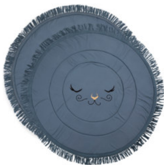
Tender Blue 70830116190NA