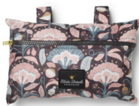
Midnight Bells 50700123554NA