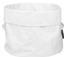
White Edition 70650112100NA