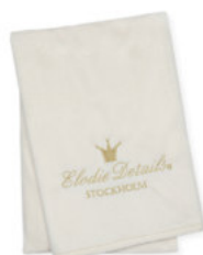
Vanilla White 30320111102NA