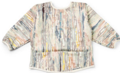
Unicorn Rain 30410102566NA