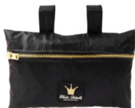
Black Edition 50700111120NA