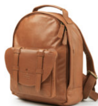
Chestnut Lzeather 50880115142NA Genuine Leather