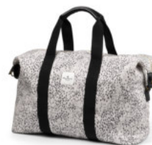
Dots of Fauna 50670118520NA