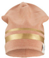
Gilded Faded Rose

50530111150DC (0-6m) 50530111150DD (6-12m) 50530111150DE (1-2y) 50530111150DF (2-3y)