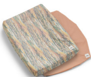
Unicorn Rain 70210115566NA