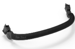
Bumper Bar 80800126120NA See website for details