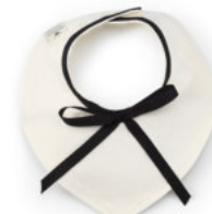
Precious Preppy 30440115108NA