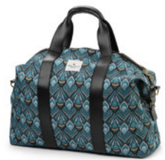
Everest Feathers 50670115532NA