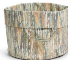
Unicorn Rain 70650126566NA