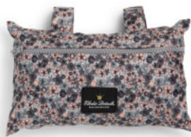
Petite Botanic 50700118560NA