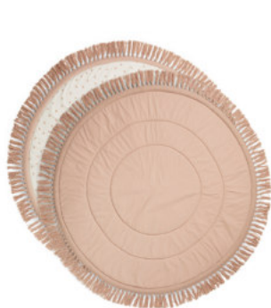
Powder Pink Fringe 70830120152NA