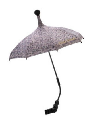
Petite Botanic 50230115760NA