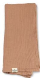
Faded Rose 30350128150NA