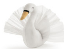
The Ugly Duckling 70370115562NA