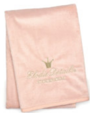
Powder Pink 30320116152NA