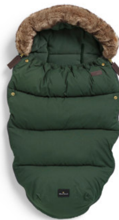
Valley Green 50500118180NA