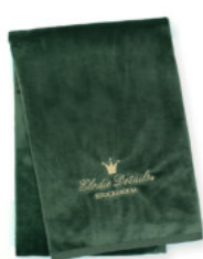
Valley Green 30320120180NA