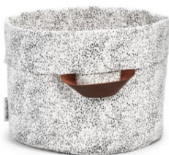
Dots of Fauna 70650120520NA