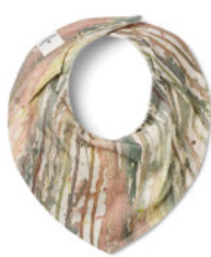
Unicorn Rain 30440123566NA