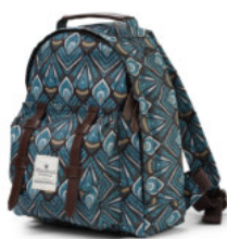
Everest Feathers 50880117532NA