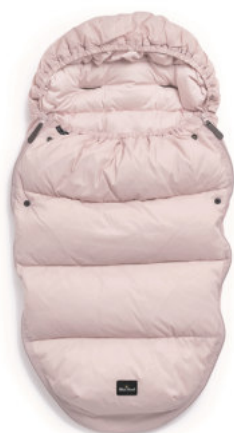
Powder Pink 50515111152NA