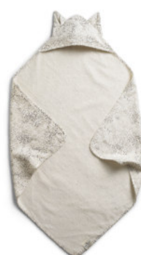
Dots of Fauna Kitty 70660115520NA