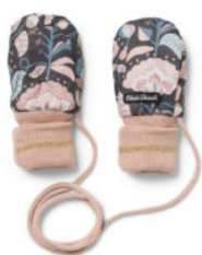
Midnight Bells 0-12m 50620119554EC