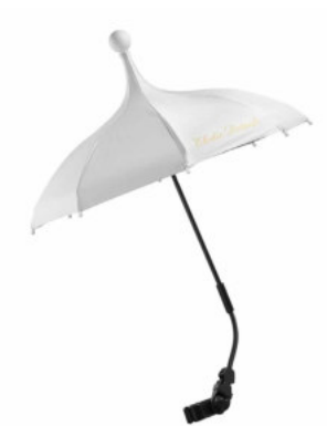
Vanilla White 50230112102NA