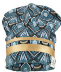
Gilded Everest Feathers

50530111150DC (0-6m) 50530111150DD (6-12m) 50530111150DE (1-2y) 50530111150DF (2-3y)