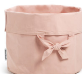
Powder Pink 70650116152NA