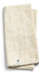
Gold Shimmer 30350119540NA