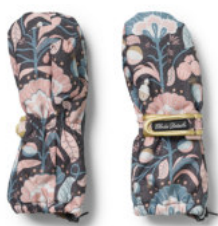
Midnight Bells 1-3y 50620120554EF